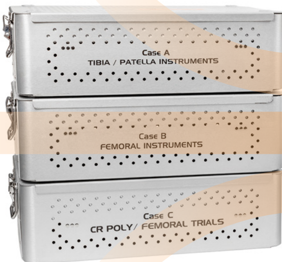
Traditional Freedom Knee Instrument Kit