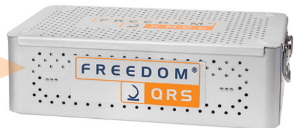
Freedom QRS Quick Tray instrument Kit